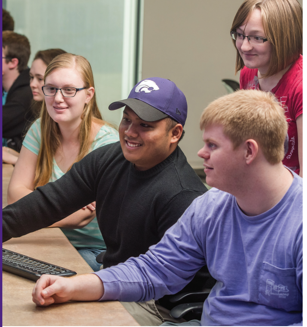
Students collaborating at a computer.