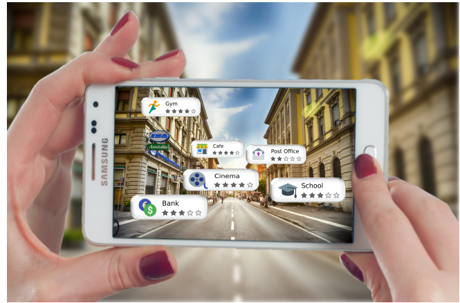
Fig. 1: An augmented reality application in tourism.

The use of AR technology in marketing is seemingly less expensive than conventional marketing approaches. Print-based advertising and marketing campaigns are relatively more expensive and require continuous investment of resources. On the other hand, AR as a computer-based technology is less expensive as it can be used in digital platforms or online. Although the development cost to setup AR-based marketing campaigns might be higher, the lifetime operating cost mostly remains stationary. This claim is evident from this statement of Rosenthal: “It honestly depends on the scope of the project, but AR campaigns can be as